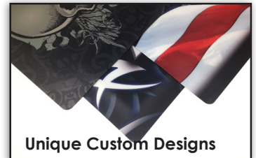
Unique Custom Designs