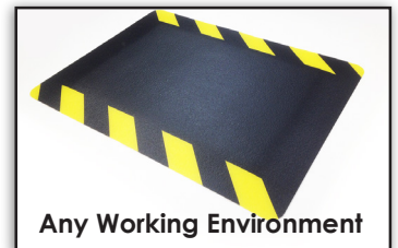
Any Working Environment